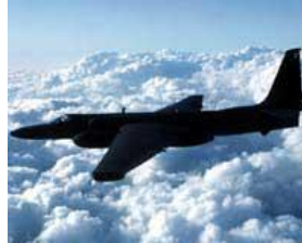
U-2 Spy Plane