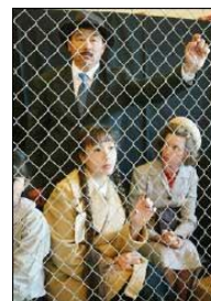
The Manzanar Relocation Center, a one of the concentration camps where Japanese-Americans were forced to live throughout World War II.