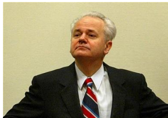
Slobodan Milosevic during his war crimes trial