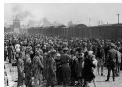
Mengele sometime before 1945 and "Selection" of Hungarian Jews on the ramp at Auschwitz-II (Birkenau), May/June 1944 during which he sought subjects for his experiments