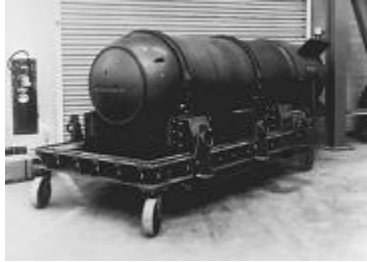
A Mk 15 nuclear 7600 pound bomb