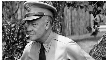
Dwight D. Eisenhower