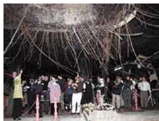
Visitors tour the Amiriyah Bunker. The Iraqi government has preserved the bunker as a public memorial.